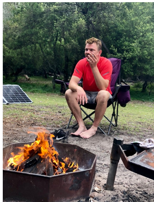
'Into The Wild' Program

Programs on offer include 'Into The Wild' and 'One-on-One Mentoring', among many others. The 'Into The Wild' experience enables men to get back to nature and be in the present. The essence of 'Into The Wild' is clarity, free-thinking and re-evaluation as an opportunity to look inwards and find truth through deep personal reflection.